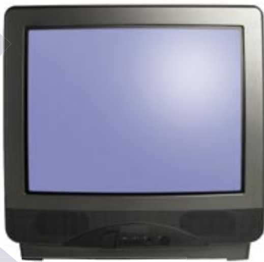
OTRUM Global 21" TV-set

Through these three principals, OTRUM Global brings both direct and indirect profitability, the system is therefore an investment in profitability, rather than a pure technology cost.